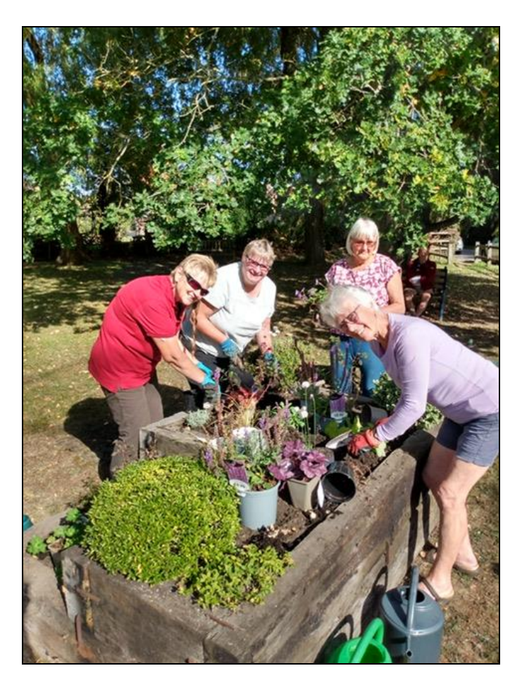
Tuesday 10<sup>th</sup> October: Members of the Grafty Green Gardening Club replanting the planters on the Village Green.